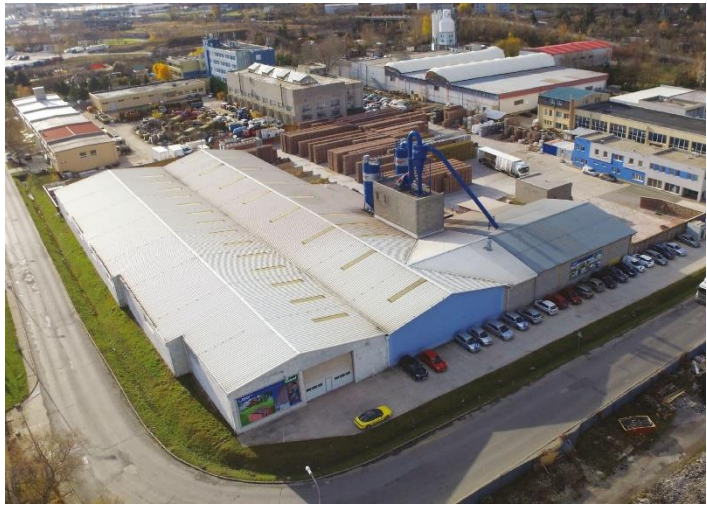
Figure 1 The view of Leier Baustoffe SK s.r.o. manufacturing plant

Leier Baustoffe SK s.r.o. is the Slovak subsidiary of the Leier Group. Founded in 2004, today it employs more than 100 people in two production plants. Wood chip concrete under the registered trademark Durisol is produced in Bratislava, western Slovakia, and ceramic bricks under the registered trademarks Leiertherm and Leierplan are produced in Petrovany, eastern Slovakia.